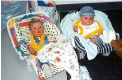
Two of our "Luau Babies" at a past Spring Social

This is going to be a dessert potluck, so be thinking of your favorite dessert to bring. The WVDSA will provide beverages, munchies, and pa-