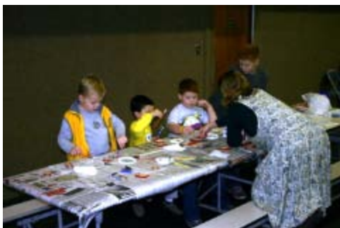
(Continued from page 1)

missed...not in a way to make them feel bad, but in a way that will make them want to come in the future."