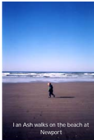
Ian Ash walks on the beach at Newport

A special event which lifted the hearts of the whole family, was when Ian was selected by the