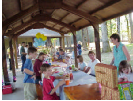
2002 Family Picnic

mean you don't have any opportunities to get together with other WVDSA friends! Make it a point to look up the other families in your area and plan a "play date" at a local park! Several Corvallis moms have been getting together on Wednesdays during the summer to let their kids play on the playground while they enjoy the chance to chat