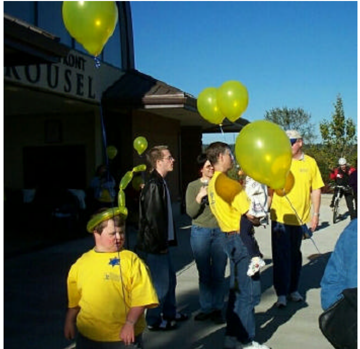
Buddy Walk 2002 in Salem, Oregon

We'll also be sending out pledge letters that you can use to copy and send out to everyone you think might like to help support our group. Feel free to make copies of this letter and emphasize the fact that donations of $25 or more gives the donor the choice of being put on our mailing list and receiving our newsletters and